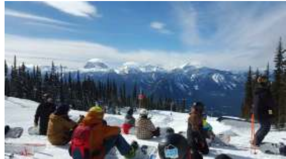
SROAMies check out Revelstoke's first park

All-in-all the trip was a once-in-a-lifetime experience for the entire class. The SROAM program, and the