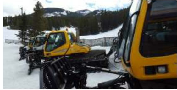
Snow Cats at Panorama