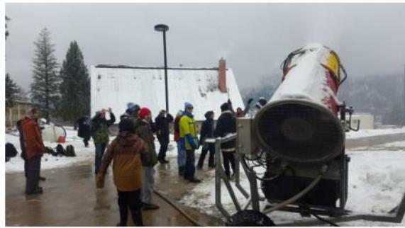
SROAM students making snow