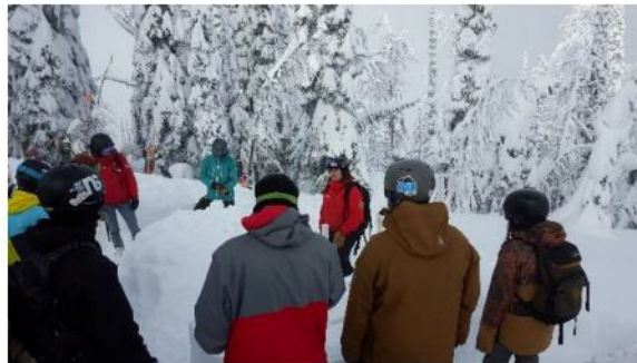
Learning all about the weather station with Whitewater's Patrol