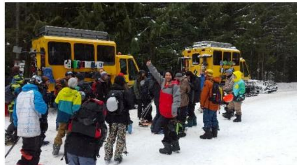
Gearing up for an unforgettable trip at Selkirk Snowcat Skiing